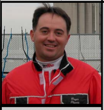
Age: 40 Birthplace: New Hampshire