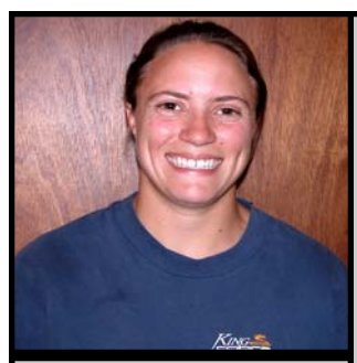
Age: 30 Birthplace: Ohio